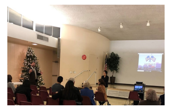
Albert O. Little Community Center, Artesia December 4, 2018