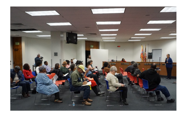
Inglewood City Hall December 12, 2018