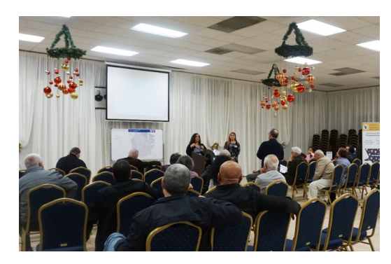
H&H Jivalagian Youth Center, Pasadena December 13, 2018