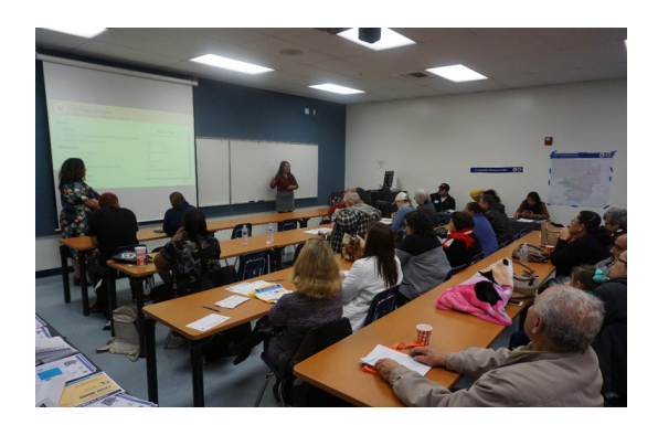
University Center of Lancaster December 12, 2018