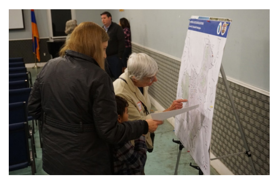
Glendale Youth Center December 14, 2018