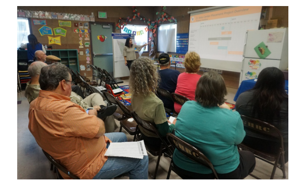
Petit Park, Granada Hills Recreation Center November 17, 2018