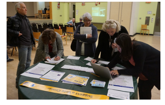
Sherman Oaks East Valley Adult Center December 3, 2018