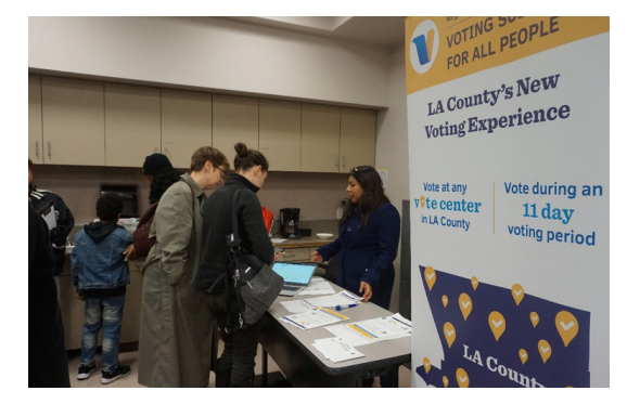
Los Angeles Fire Station, North Hollywood November 29, 2018