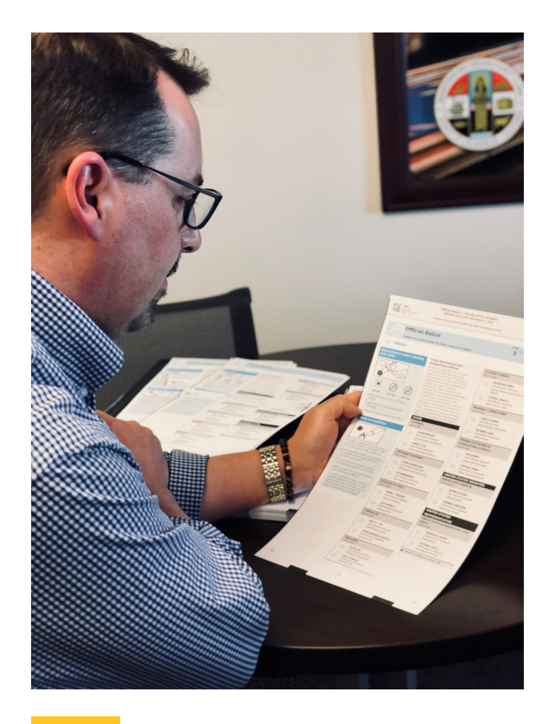
Registrar-Recorder/County Clerk Dean Logan with the new VBM ballot design

In total, the RR/CC processed 1,350,313 VBM ballots, the highest number of VBM ballots in any election!