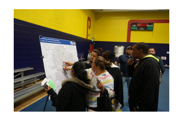
Salvation Army, Compton November 16, 2018