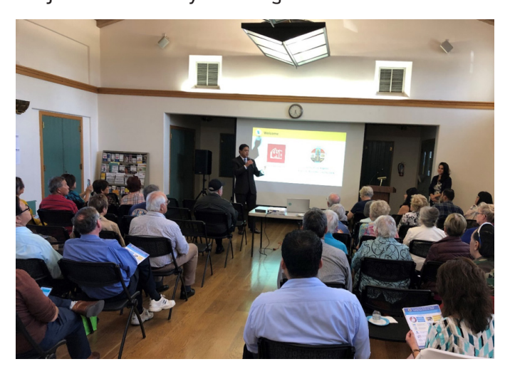
Second round of Vote Center Placement Project Community Meetings