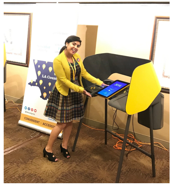
Future of California Elections Bootcamp: L.A. County Elections 2020