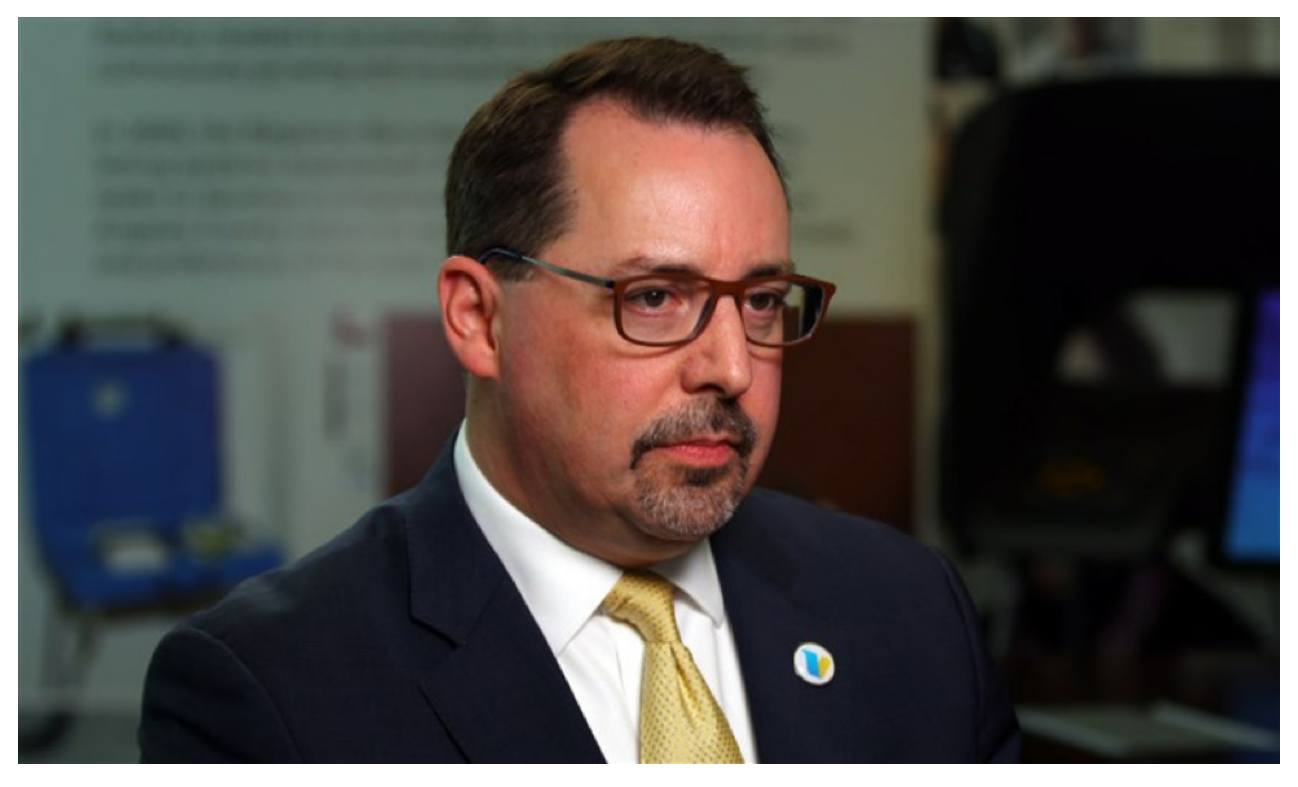
Dean Logan oversees the Los Angeles County Registrar-Recorder/County Clerk, the largest voting district in the United States.

For 2020, the nation's biggest voting district decided to grow its own voting machines and change the meaning of "Election Day." The reviews are glowing.