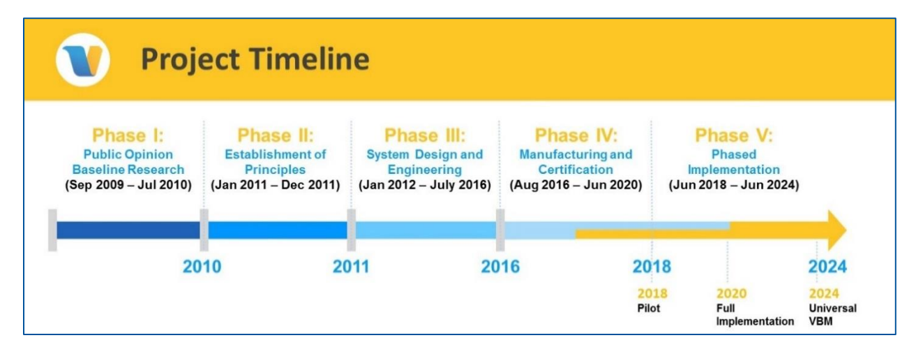
Figure 2. VSAP Timeline

VSAP is a five-phase plan to modernize the County's voting systems and the voting experience through a voter-centered approach. Phases I through III are complete. Figure 2 summarizes VSAP phases and the overall timeline.