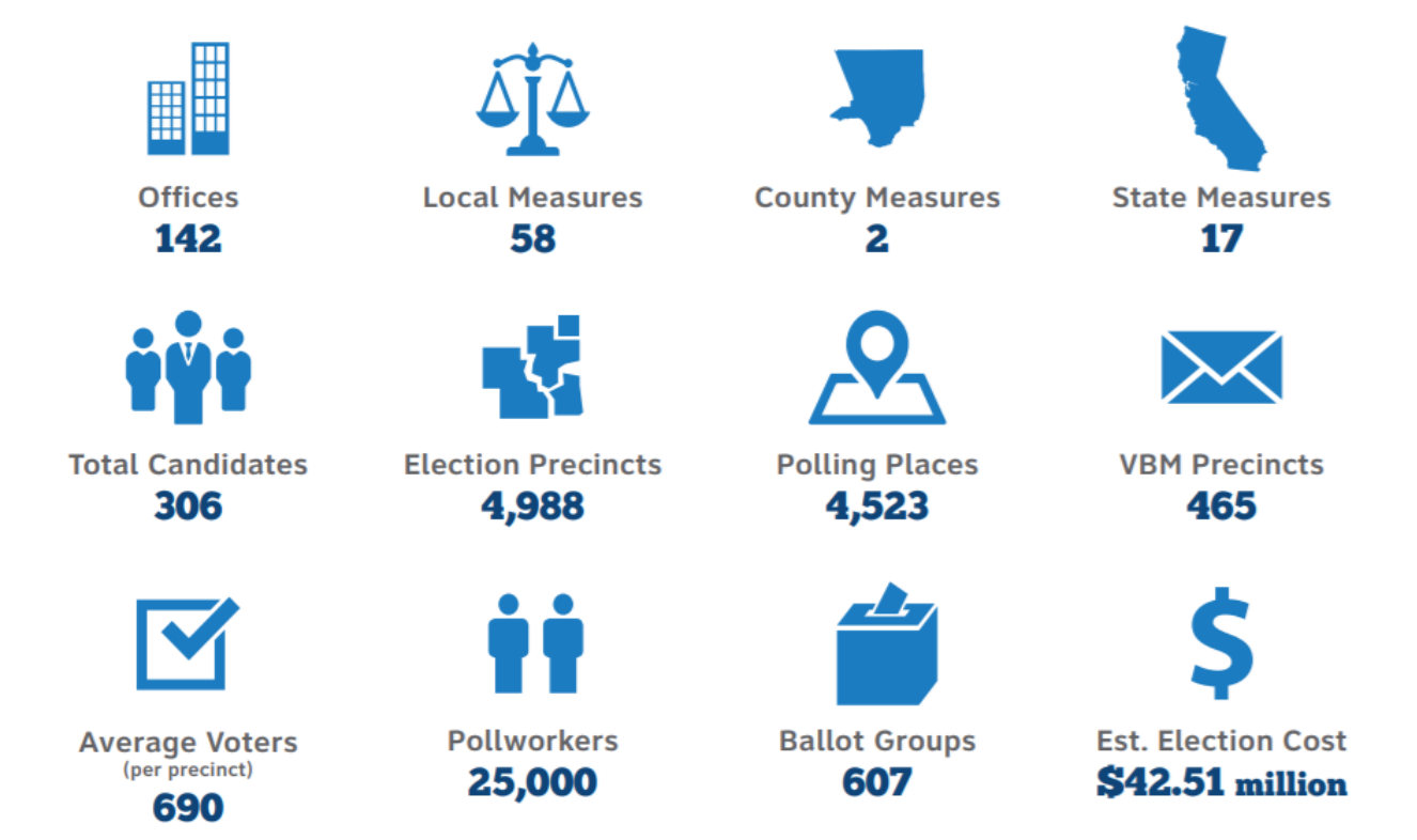
Figure 1. Profile of the 2016 General Election