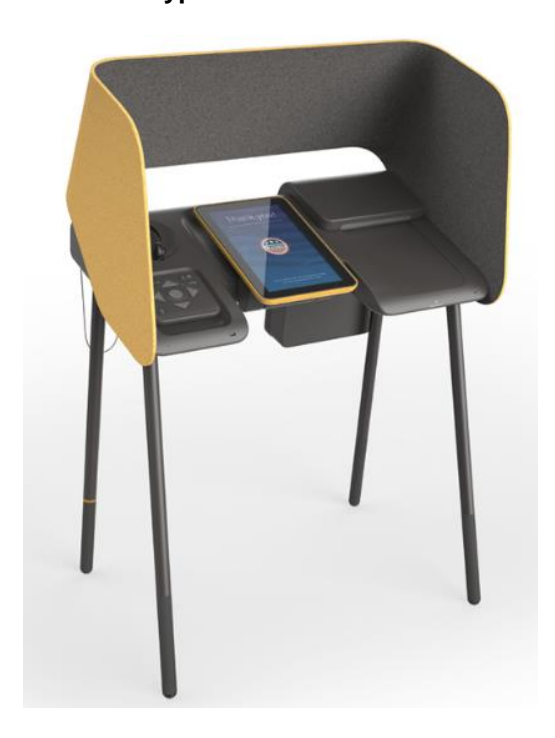
Figure 4. Ballot Marking Device Prototype

Voters can use the BMDs to generate, print, verify and cast a paper ballot that records the voter's selections on the ballot in human readable text (the vote of record) and encodes the selections in a machine-readable QR Code format. The architecture of the BMD is designed to facilitate voting for voters with a wide range of cognitive and physical abilities, and language needs, to maintain the voter's privacy and independence, and to protect the integrity of the vote. The BMD also supports the hands-free casting of the paper ballot into an integrated ballot box. The concept is that all voters will be able to vote on the same device by customizing their experience. Once the voter has marked his/her intended votes, a thermal printer embedded in the BMD will print/mark the voter's ballot with his/her vote selections in human-readable text for the voter to review and validate to ensure it reflects their selections, as well as the QR Code encoded with those same selections. The County anticipates needing between 25,000 and 32,000 BMDs at the time of full implementation.