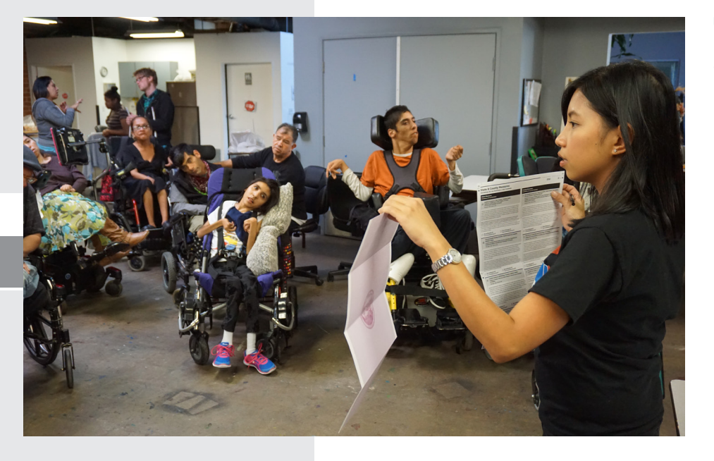
Focus Group Discussion with the members of UCPLA

The Department and IDEO are currently evaluating and analyzing the data gathered from the phone interviews. The data will be used to refine the proposed Vote By Mail design to accommodate the ideas and suggestions from the user testing.